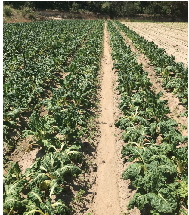
No compost applied