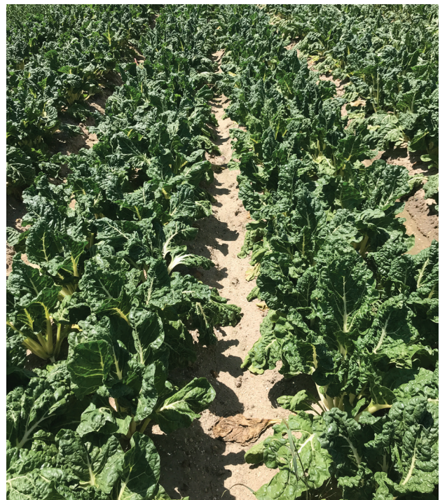
Compost applied at 10 t/ha